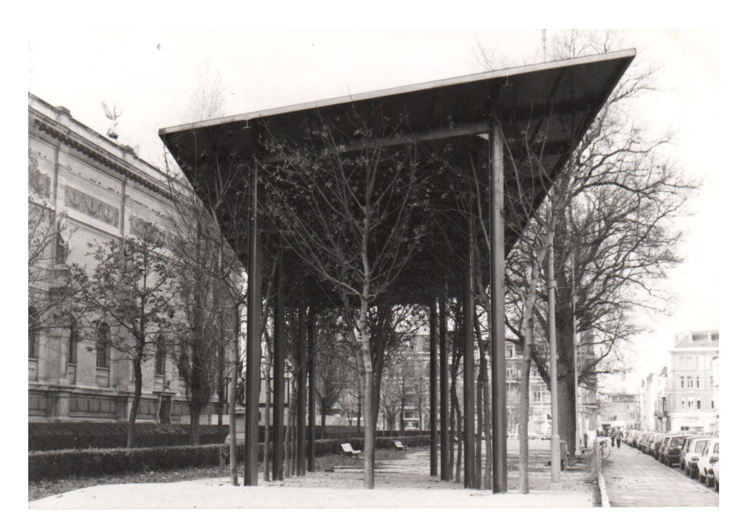
Figure 1. David Lamelas, Quand le ciel bas et lourd (When the sky is low and heavy) , 1992. Installation consisting of metal sculpture and trees on inclined surface. 6 \times 20 \times 7.8 m. Collection M HKA, Museum of Contemporary Art Antwerp.

This article uses Lamelas' work as a lens to examine two aspects of contemporary art and history in Flanders. Firstly, it foregrounds the complex, transnational heritage that Lamelas' work presents. The article considers Lamelas' works and exhibitions made in Belgium in the late 1960s and 70s, and again in the early 1990s, exploring his relations to the local artistic avant-garde. Secondly, the text frames Quand le ciel bas et lourd and America: Bride of the Sun within cultural and political developments in Flanders in the early 1990s. The work and show were realized within months of "Black Sunday", the notorious 1991 federal election that marked the rise of the Vlaams Blok (now Vlaams Belang) and, with it, radical-right nationalism in Flanders. Together these sections illuminate how Lamelas' work might challenge monolithic formations of Flemish art.