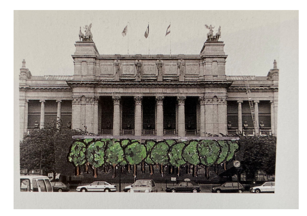
Figure 6. David Lamelas, Initial proposal for the location of the work at the main entrance of the KMSKA (not realized). Drawing on photograph of the Royal Museum of Fine Arts Antwerp reproduced in the exhibition catalogue America, Bride of the Sun, 500 years Latin Amerca and the Low Countries , 1991, KMSKA (Pisters and Vandenbroeck 1991, p. 244).

gallery, and collectors Herman and Nicole Daled.<sup>30</sup> Quand le ciel bas et lourd 's Baudelairean title is just another echo of the intricate ties between Lamelas, Broodthaers and Belgium manifest in the work.