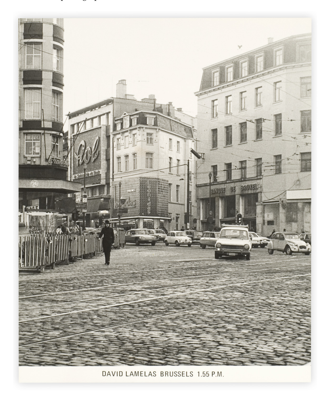
Figure 2. David Lamelas, Antwerp-Brussels ( People + Time ), 1969. Black and white photograph, 29.5 \times 23.5 cm.

constituted what De Decker called the "Belgium group", which achieved an international reputation as an active "unconstituted, ephemeral and natural" circle in the contemporary art scene (De Decker and Lohaus 1995, p. 32; Buren 1995, p. 103). In hindsight they are significant for their key role in the development of post-war avant-garde art in Belgium and internationally. Therefore, it is interesting that Lamelas, an artist from Argentina who started studying at St. Martin's School of Art in London in 1968, would include himself in this series of photographs.