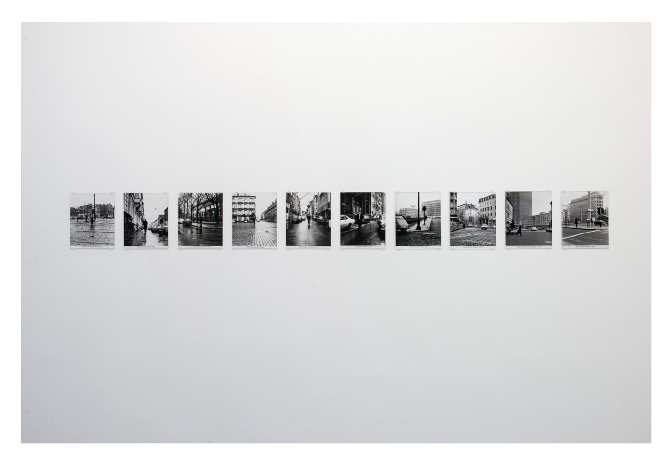
Figure 3. David Lamelas, Antwerp-Brussels (People + Time) , 1969. 10 black and white photographs, 29.7 \times 23.6 cm each, 31.5 \times 26. \times 2 cm (signed and numbered portfolio). Edition of 10 (of 7 produced editions). Installation view, On Kawara, David Lamelas at Jan Mot, Brussels, 2019.

This is especially so when we look at similar time pieces by Lamelas from 1969–1970, where his presence is conspicuously absent: Time as activity (Dusseldorf) (1969), Gente di Milano (1969) and Film 18 Paris IV . 70 (also known as People + Time: Paris) (1970).<sup>4</sup> In each of these works Lamelas turns the camera towards the city in a documentary manner capturing its people and activity in fragments of time. However, as much as they were meditations on time, they were also profiles of a place. In his words, Lamelas claimed to "appropriate the social and spatial life of the city." (Lamelas [2016] 2017, p. 167) Antwerp–Brussels is equally "site-specific", a term used by Lamelas to describe the way it incorporated the physical and social conditions of a particular location as integral to the artwork. The cities of Antwerp and Brussels are not only determined by their geographic and urban structures, but also their social relations and, more specifically, artistic network. Lamelas' insertion of himself into this configuration reveals the extent to which he identified with these locations and contexts, and even imagined himself as a component of them. The photographic series certainly attests to Lamelas being there and having a place within "Antwerp-Brussels" in the year 1969.