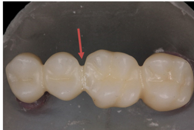
Figure 1. Exemplary picture of prevailing failure mode by cracking in the connector area (arrow).