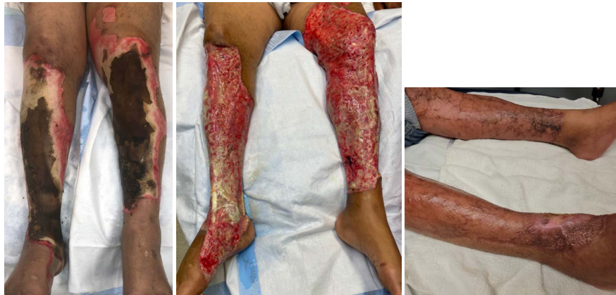
Figure 1. Second and third degree burn injuries; after initial debridement; and twenty-two weeks after initial injury.

bones were exposed on the right lower extremity. On initial exam, bilateral pedal pulses were present, and all toes had less than two second capillary refill. Sensation, motor, and strength were normal. During the 48-day-hospital stay, the patient had eight operations. There were weekly tangential excisional debridements of necrotic tissue with weekly application of one or more of the following placental allografts: dHACM, dHCM ( Figure 2 ), dHUC ( Figure 3 ), or mdHACM ( Figure 4 ). The dHACM, dHCM and dHUC were used initially on both legs (week 2), then only on the right ankle (weeks 3 - 6). In addition, mdHACM was injected into the three exposed tendons of the right foot (weeks 4 - 5). When a wound infection needed to be treated, a combination of intravenous antibiotics and a topical antiseptic wash such as hypochlorous acid (Vashe Wound Solution, UMNA, Fort Worth, Texas) was used.