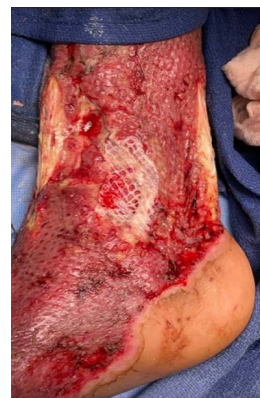
Figure 3. Application of dHUC over the flexor digitorum longus tendon.