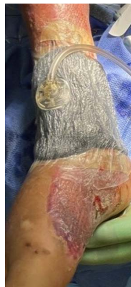
Figure 6. Application of negative pressure wound therapy with black granufoam over the nonadherent dressing.