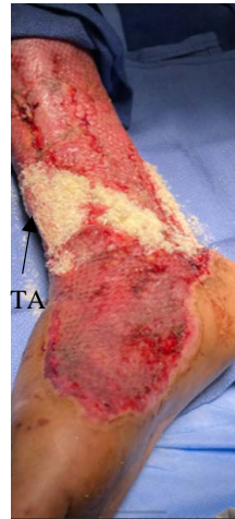
Figure 2. Application of dHCM over the exposed tendons.