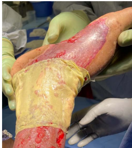
Figure 5. Application of nonadherent dressing, 3% bismuth tribromophenate petrolatum dressing with a glycerol-hydroxyethyl cellulose lubricant.

The incorporation of four placental allografts (dHCM, dHACM, dHUC, and mdHACM) into this current limb salvage protocol preserved the extremity at risk for more invasive procedures—either a myocutaneous flap or amputation.