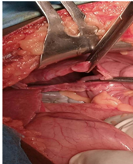
Figure 3. Intraoperative image of left side TDI in a patient at Gabriel Toure University Hospital.

The diagnosis of TDI was made preoperatively in 10 patients (21.7%) and intraoperatively in 36 patients (78.3%). The diaphragmatic breach was located on the left side in 30 cases (65.2%) ( Figure 3 ) and on the right side in 16 cases (34.8%). The diaphragmatic injury was single in 43 cases (93.5%), double in 3 cases (6.5%). The average size of the injury was 3.17 cm with extremes of 1 cm and 10 cm. TDI was associated with other injuries in 69.6% ( Table 4 ). A diaphragmatic hernia was found in 7 cases (15.2%).