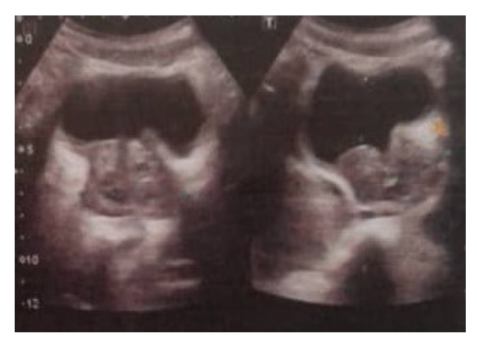
Figure 1. Homogeneous prostate hypertrophy with significant post-void residual.

suspected prostate cancer. The histological examination showed epithelioid gigantocellular granuloma with isolated caseous necrosis in 61.53% of patients and associated adenomyomatous hyperplasia in 38.47% of patients ( Figure 2 and Figure 3 ).