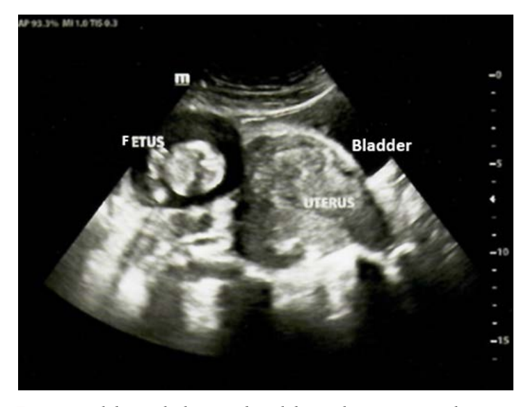
Figure 1. Abdominal ultrasound - Abdominal pregnancy with empty uterus and poorly visualized posterior placenta.

An abdominal ultrasound on admission showed an evolving monofetal abdominal pregnancy consistent with gestational age, a normal empty uterus, and a fluid effusion in the Douglas cul-de-sac. The placenta was posterior, but its margins were not well visualized (Figure 1).