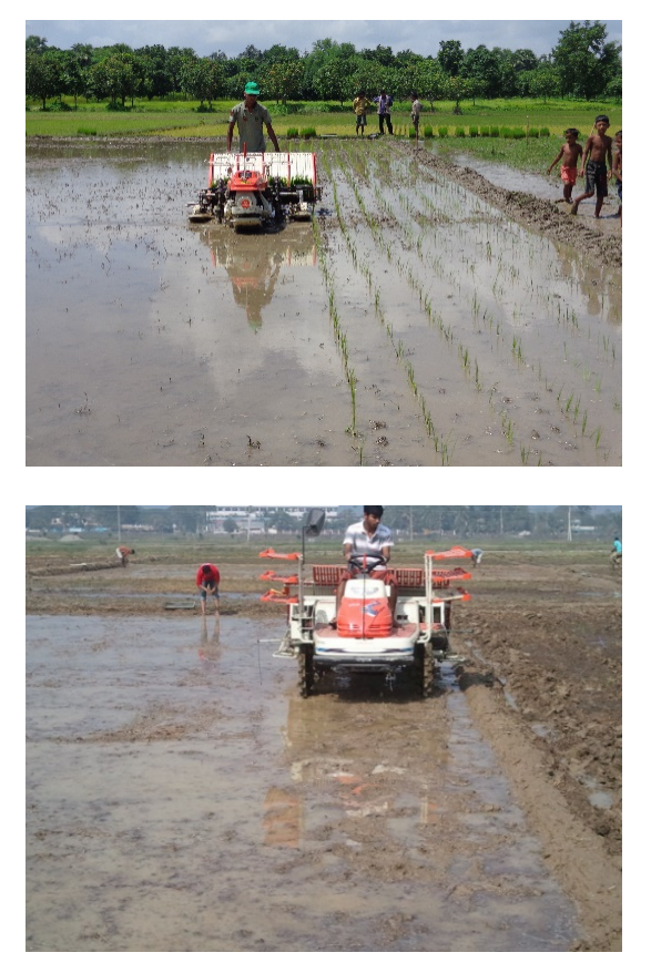
Figure 2. Field operation of the walk behind type and riding type rice transplanter.

Walking type 8 row transplanter was not available in Bangladesh but 6 rows are now importing some companies which are under evaluation. The scenario of adoption of self-impelled paddy transplanting technology among paddy cultivators of Bangladesh is still low, which calls for improved innovation and upgraded extension services for promoting the self-propelled paddy transplanting innovation. The transplanter with the incorporation of deep placement of fertilizer applicator is one of the conceivable adjustments that should have been presented. The important role of urea has great potential in most small-scale rice farmers in Asia, where farmers are generally deprived of resources [36]. From this point of view, BRRI modified the walk-behind type rice transplanter by incorporating fertilizer deep placement mechanism under NATP-2 funded project [12]. This is under the adoption stage. There is a need to promote self-propelled walking type rice transplanters for small and medium land holdings rice. It is necessary to promote a power operated walk-behind type rice transplanter for small and medium-sized rice farmers. The walking and riding type rice transplanter (Figure 2) might be presented on enormous size land hanging on a custom employing premise.