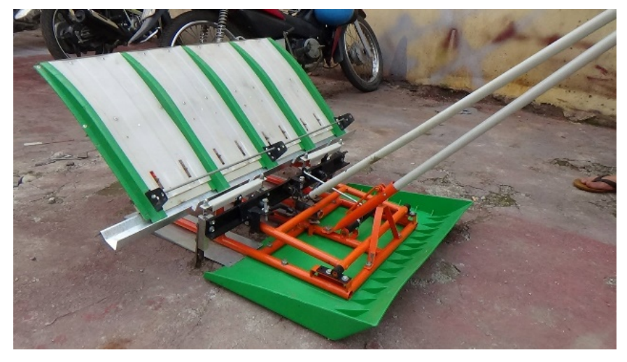
Figure 1. Field operation of the BRRI developed manual rice transplanter.