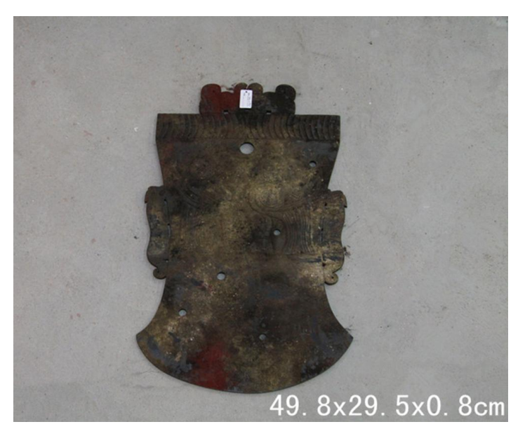
Figure 4 . Jade with cinnabar.