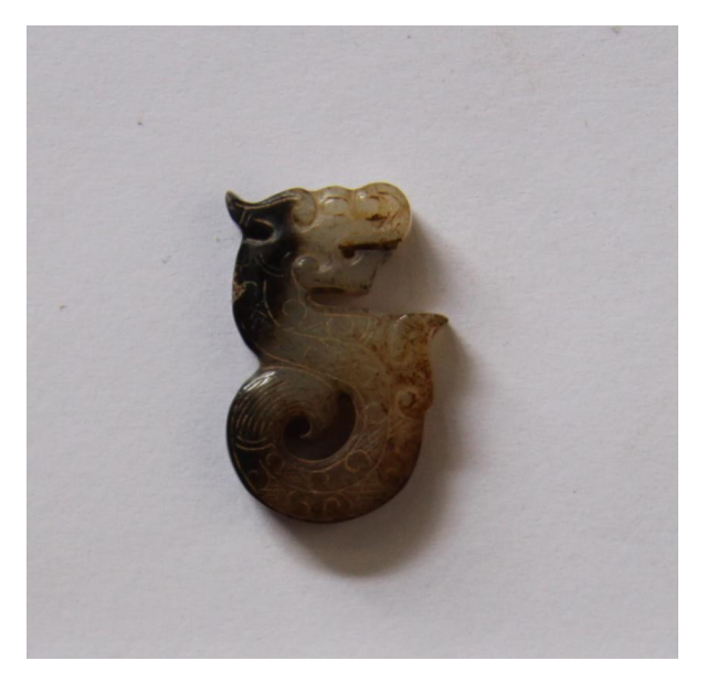
Figure 2. Mercury percolation jade.

"Chicken bone white" is a common type of modern antique fake quality change, although there is still no consensus in the academic community on the formation of excavated "chicken bone white" jade, however, the mineral characteristics have not changed from the current study of the material (Zhu et al., 2002), while modern imitations of "chicken bone white" are usually whitened by high-temperature heating. Figure 3 shows the appearance changes of original jade and after heating at 1000°C. The heated jade will change in the spectral peaks by Raman spectroscopy, and the spectral peaks of some characteristic points will weaken or even disappear, while there is no such spectral change in the excavated jade. This phenomenon can effectively identify whether the jade has been heated at high temperature or not (Chen et al., 2007).