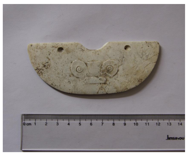
Figure 1. Chicken bone white jade.