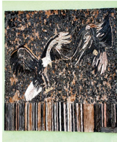
Figure 20. “Lovers” 2019, Tyres × 118 cm.