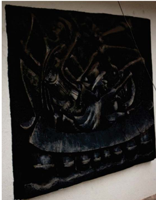
Figure 19. “Music” 2005, Concrete cement, 54 cm × 51 cm.