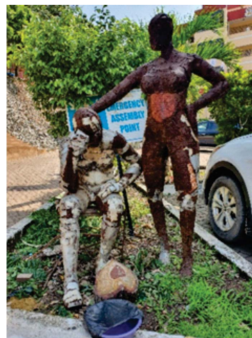
Figure 4. “Companion” 2017, Mild steel, Iron rods, 187 cm × 98 cm × 67 cm.