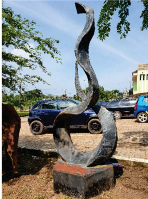
Figure 8. “Nkyinkyim” 2017, Mild steel, Iron rods, 140 cm × 97 cm × 60 cm.