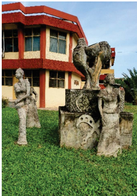
Figure 13. "Knowledge" 2006, Concrete cement, 123 cm × 110 cm × 97 cm.

Brief description of the artworks: works are in-the-round cement sculptures. The technique used was direct modelling, casting and construction with lighting finishes.