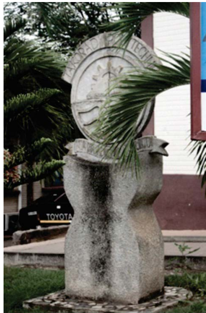
Figure 17. “Cenotaph” 2008, Concrete cement, 154 cm × 43 cm × 54 cm.

Brief description of the artworks: Both works are relief and in-the-round cement sculptures. The technique used was direct modelling, casting and construction.