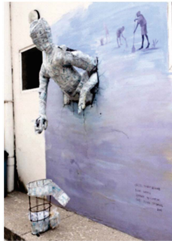
Figure 21. “Emerging” 2016, Iron-197 cm rods, Satchet rubbers and Metal, 67 cm × 54 cm × 43 cm.