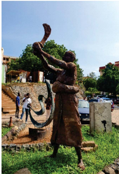
Figure 5. “The chosen one” 2016, Mild steel, Iron rods, 367 cm × 65 cm × 67 cm.

Brief description of the artworks: They are in-the-round metal sculptures. The technique used was assemblage and construction with fabrication and arc welding methods.