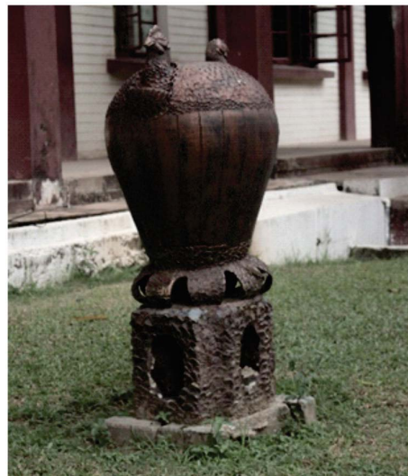
Figure 16. "Diligence" 2004, Concrete cement, 123 cm × 65 cm × 56 cm.