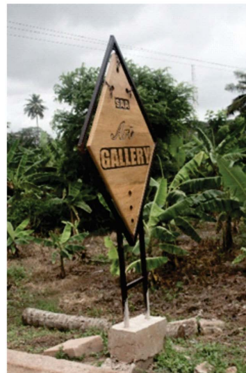
Figure 22. “Signage” 2018, Wood and Concrete cement, 167 cm × 43 cm × 30 cm.