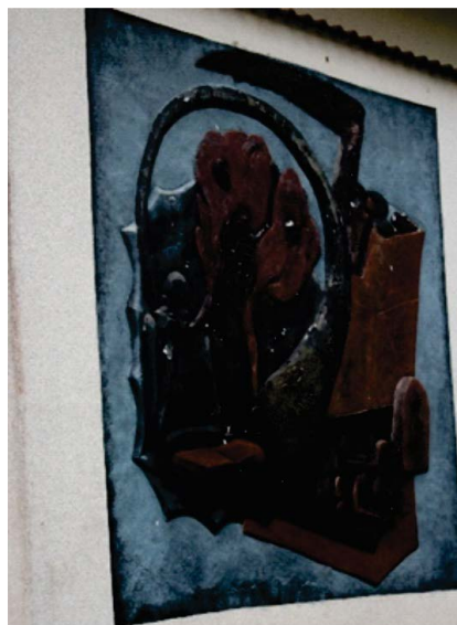
Figure 18. “Wise saying” 2005, Concrete cement, 145 cm × 118 cm.