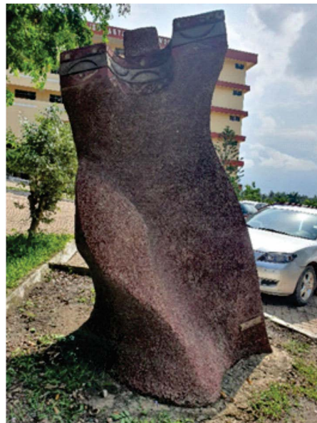
Figure 10. “Township Dance” 2018, Concrete cement, 198 cm × 56 cm × 59 cm.