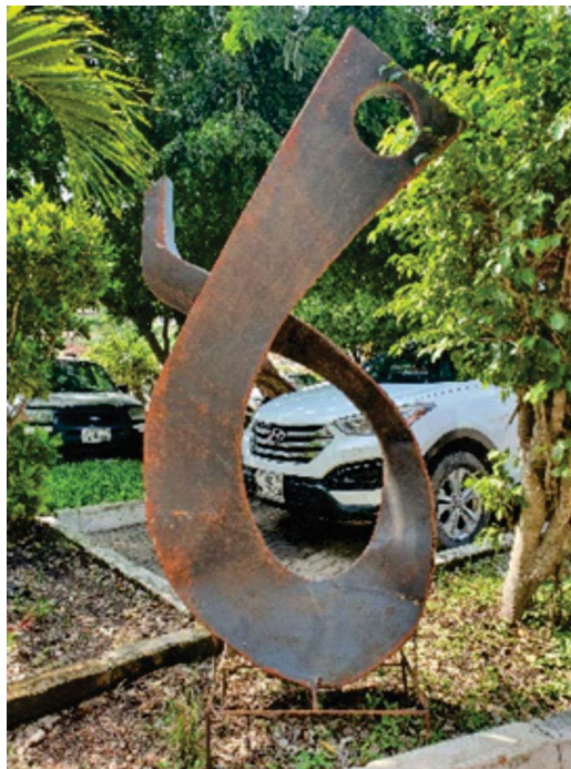
Figure 7. “Sankofa” 2017, Mild steel, Iron rods, 138 cm × 99 cm × 67 cm.

Brief description of the artworks: works are in-the-round metal sculptures. The technique used was assemblage and construction with fabrication and arc welding methods.