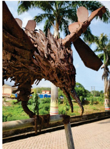
Figure 3. “Vigilance” 2016, Mild steel, Iron rods, 265 cm × 76 cm × 54 cm.