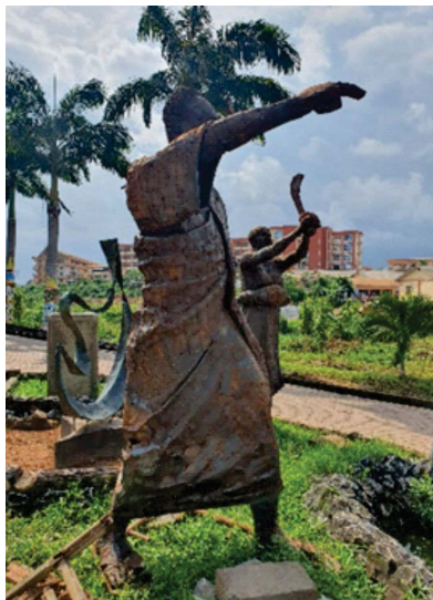
Figure 6. “Forward Ever, Backward-Never” 2016, Mild steel, Iron rods, 376 cm × 67 cm × 66 cm.