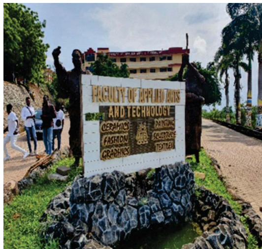
Figure 11. “The Signage” 2018, Concrete cement, 126 cm × 98 cm × 90 cm.

Brief description of the artworks: Both works are relief and in-the-round cement sculptures. The technique used was direct modelling, construction with fountain finishes.