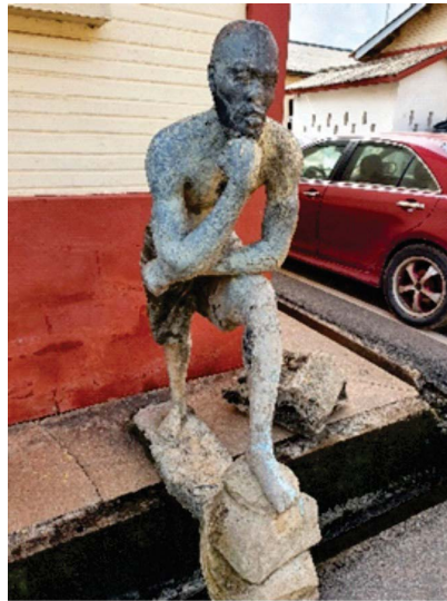
Figure 15. "Thinker" 2017, Concrete cement, 198 cm × 165 cm × 61 cm.