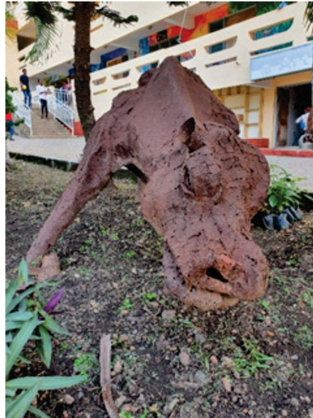
Figure 2. “Resilient” 2015, Mild steel, Iron rods, 189 cm × 148 cm × 97 cm.

Information provided by the artists (material, execution technique, meaning/idea behind the artwork): No document on the sculpture by the artists.