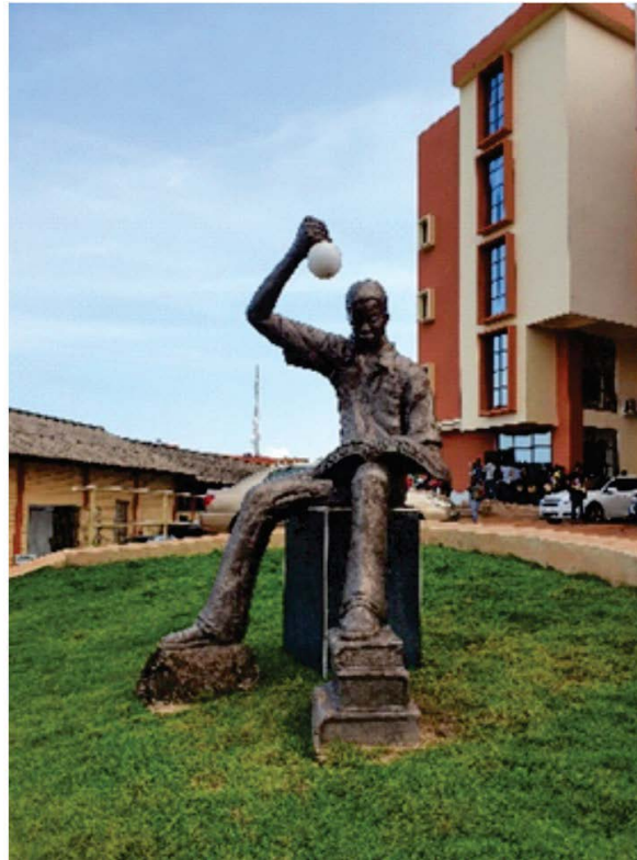
Figure 14. “Learner” 2005, Concrete cement, 198 cm × 87 cm × 85 cm.