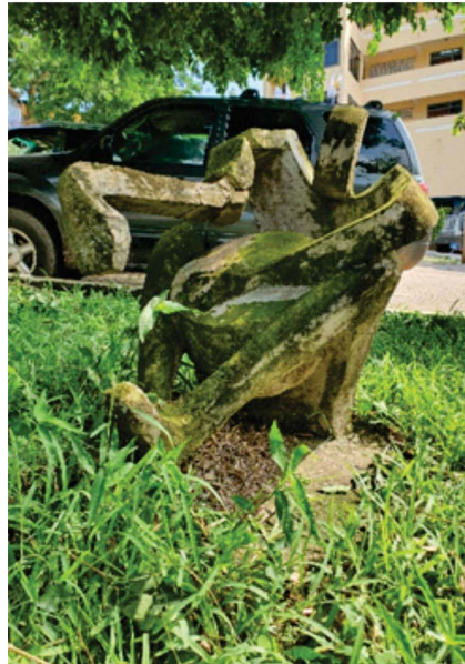
Figure 9. “The Drummer” 2016, Concrete cement, 87 cm × 78 cm × 45 cm.