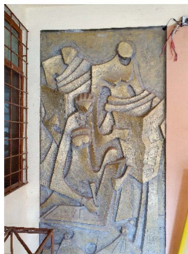
Figure 12. “Tradition” 2002, Concrete cement, 132 cm × 99 cm.