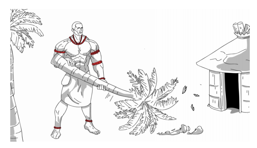
Figure 6. Aruanran, according to folkstories, grew up to be a giant who used the tall palm tree to dust the ground (authors).