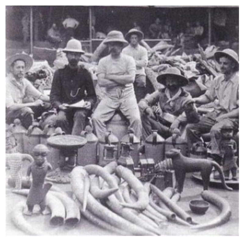
Figure 2. Membes of the Punitive Expedition of 1897 posing with looted Bini artefacts (Opoku, 2015).

1) What are the various intangible cultural heritage in the ancient Bini kingdom?