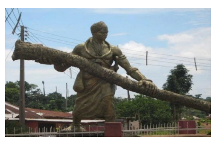
Figure 3. Statue of Aruanran, the giant of Bini kingdom (Steemit, 2019).

Several folk stories of the ancient Bini Kingdom were discovered in a book by Eweka (1998) that enumerated several stories that were passed down through oral tradition. They include "Later Arrivals", "The Great Debate", "On Their Own", "Leopard and its Spots", "Never too Weak to Help", "Tortoise and the King", "The Undaunted Destiny", "All or Nothing" and "More Powerful than Death". Additionally, Ben-Amos (1967) identified and captured the stories of "Ozolua and Izevbokun" and "Igoroumi". The elders in the Oba's palace recounted the story of Aruan [Arhuanran (sometimes spelled Aruanran)] of Udo, the giant of Bini Kingdom (Figure 3), and brother to Oba Esegie (Figure 4), which was confirmed with the publication by Steemit (2019). Figure 5 shows the