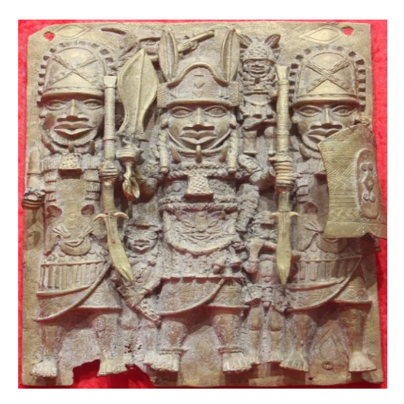
Figure 5. Oba Ozulua (Steemit, 2019).

image of Oba Ozulua, the father of Aruanran, and Oba Esegie, preparing for war. The illustrations of Bortolot (2003) described the story of Queen Idia, the first queen mother of Bini. Emielu (2012) described several music and dance of the Bini people. All these provided the base upon which the digital characters were built.