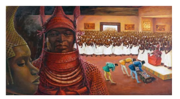
Figure 4. Oba Esegie brother to Aruanran (painted by Erhabor Enopae).