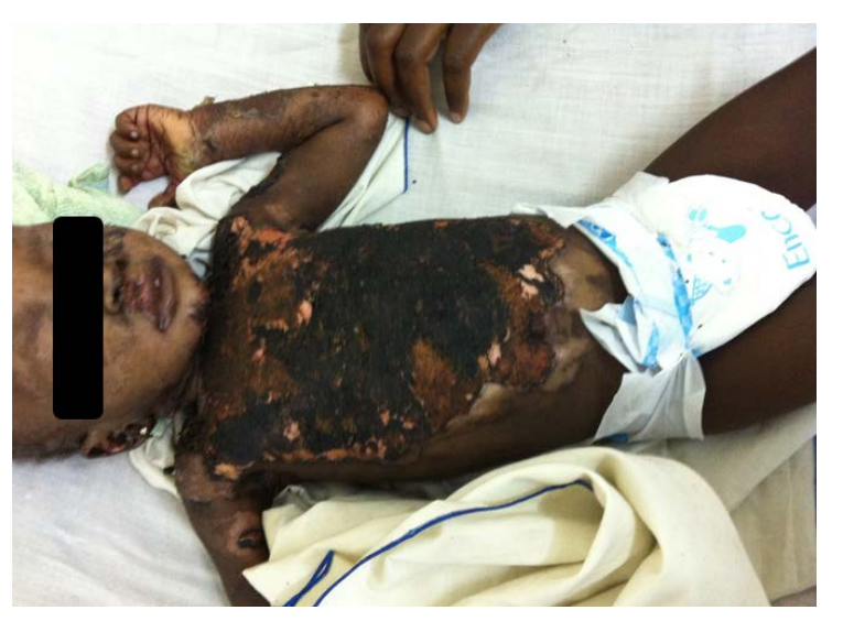
Figure 2. Month old child with burn injuries dressed with cow dung.

Adequate education of the general public about the dangers of burns and how to prevent burns will go a long way to reduce the burden of burn injuries. For example, people should be taught to take a bucket of cold water to the kitchen to mix the hot water in the kitchen rather than transporting hot steaming buckets of water to the bathroom. Similarly, the Ghanaian public should be encouraged to stand lit candles on non-combustible materials. In the use of LPG Cylinders safety precautions such as keeping the cylinders outside and passing the tube