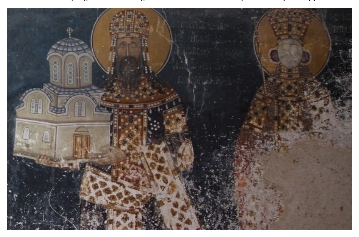
Figure 4. King Milutin carrying church and Queen Symonis, fresco, 1318–1319 King's church, Sts. Joachim and Anne, Studenica Monastery

catholicon, the dedication of the church to St. Joachim and St. Anne, the representation of Christ's genealogy on the chapel's frescoes and their programmatic relation with the personalities of the King's ancestors had a specific theological and ideological basis. They were conceived to stress the parallels between Christ's (Sts. Joachim and Anne) and King Milutin's (St. Symeon Nemanja) ancestors, i.e., between Christ and King Milutin himself [13] (pp. 191–195). The idea of ancestry, however, permeates the overall painted program of the King's Church much more comprehensively [14] (pp. 187–191).