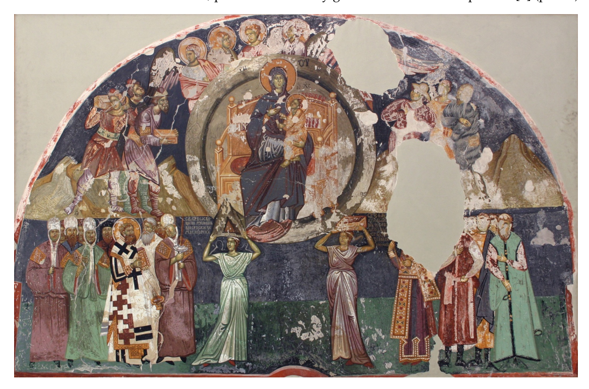
Figure 2. King Milutin leading ceremonial procession within the scene of the Christmas Hymn (right), fresco, 1309–1316. Ascension Church of the Žiča Monastery, south side of the lunette above the entrance.

not selected by chance. The entrance into the narthex of the main cathedral church was the place where, according to the rules of the Constantinople rite, the two processions met ahead of the liturgy, one led by the secular ruler and the other by the spiritual leader. By quoting this ceremony within a scene that refers to gifts and serving the God incarnate, the person who devised the composition in Žiča stressed the exalted aspect of the mission of the Serbian king and the archbishop. By carrying out this mission, according to Vojvodić, they both confirmed the Christian legitimacy of their dignity and, together with the whole of the universe, presented a worthy gift to the source of all powers [8] (p. 538).