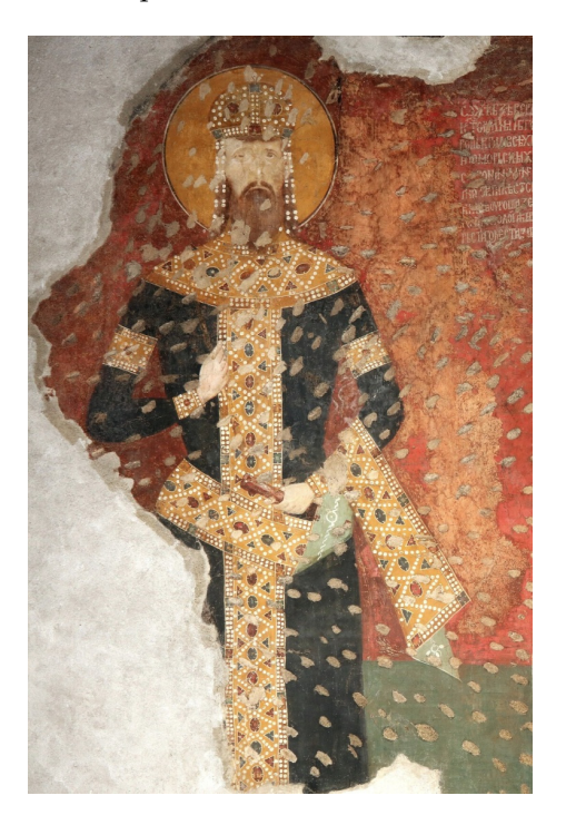
Figure 1. King Milutin, fresco, 1310–1313. Holy Virgin Ljeviška church in Prizren, north side of the east wall of the narthex

with the crown on his head and the long inscription that reads: "in Christ, the God faithful, despot and of holy birth, and pious Stefan Uroš, king of all Serbian lands and Littoral, great-grandson of Saint Symeon Nemanja, grandson of the First-Crowned King Stefan, son-in-law of the great Greek Emperor Palaiologos Kyr Andronikos and the endower of this holy place" (Figure 1). The purpose of the painting was to confirm and highlight Milutin's legitimacy on the throne of Serbia and his alliance with the ruling Byzantine Emperor. As a result, he was not depicted with the church in his arms, unlike the usual representation of ktetorship in the Serbian endowments.