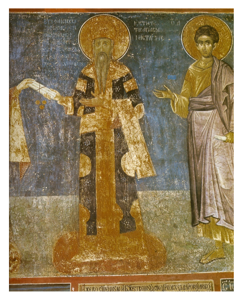
Figure 8. King Milutin, fresco, 1321. Church of the Presentation of the Virgin, Monastery of Chilandar, southern part of the second zone of the east wall of the narthex.