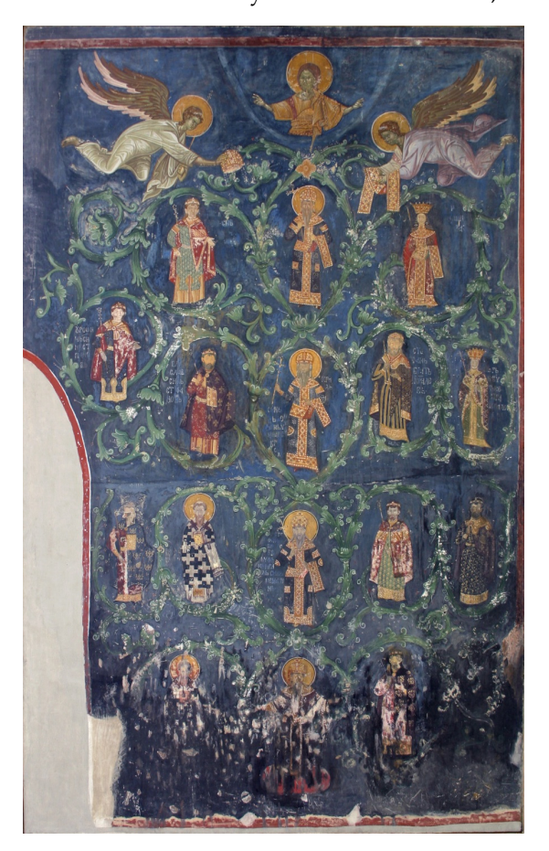
Figure 6. Nemanide's Genealogical Tree, fresco, 1321. Church of Annunciation, Monastery of Gračanica, south part of the eastern wall of the narthex.