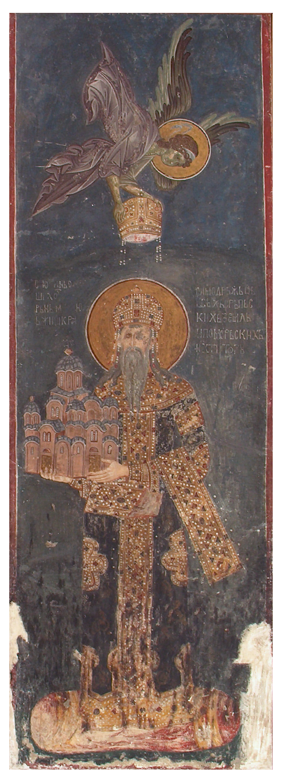
Figure 5. King Milutin with the church, fresco, 1321. Church of Annunciation, Monastery of Gračanica, northern part of the vault between the narthex and nave.

Nonetheless, the most interesting type of Serbian historical painting that appears in Gračanica for the first time is the so-called Nemanide Genealogical Tree (Figure 6). The fresco is located on the south part of the eastern wall of the narthex and measures about 1.75 m in wide and about 3.25 m in high. Sixteen portraits of Nemanide family members, arranged in four rows and entwined in an ivy vine, are represented. St. Stefan Nemanja, dressed in purple clothes with a halo, is in the center of the first row, representing the