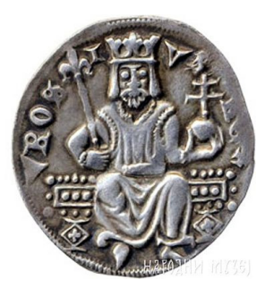
Figure 9. Milutin's silver dinar, obverse and reverse of silver coin after 1282.