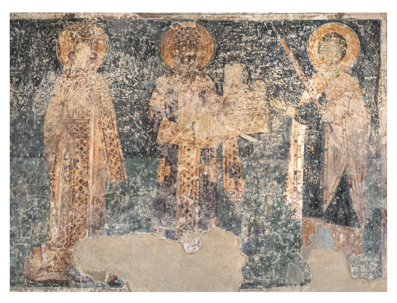
Figure 3. King Milutin with the church, fresco, 1317–1318. Church of St. George Tropaioforos, Monastery of Staro Nagoričino, north wall of the narthex.