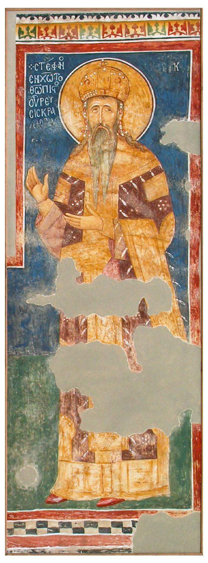
Figure 7. King Milutin fresco, 1321. Church of the Presentation of the Virgin, Monastery of Chilandar, southwest corner of the nave.