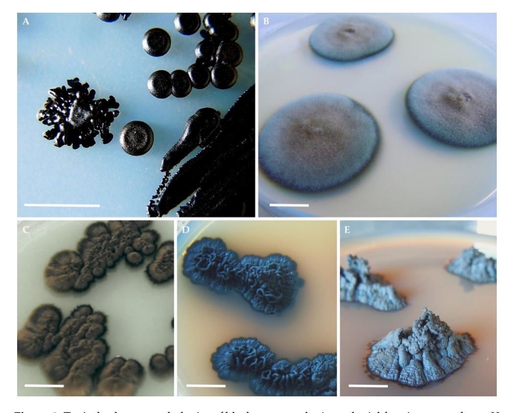
Figure 1. Typical colony morphologies of black yeasts and microcolonial fungi on agar plates. Hortaea werneckii ( A ); Cladophialophora immunda ( B ); Exophiala dermatitidis ( C ); Knufia chersonesos ( D ); Cryomyces antarcticus ( E ). Scale bars: 1 cm.